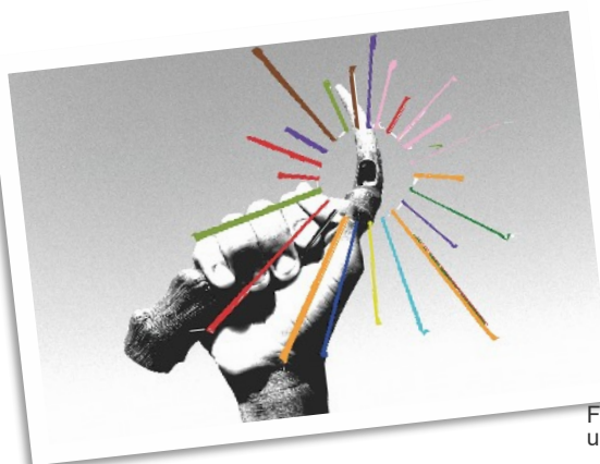
Figure 1: logo of the festival

Festival (Refer to Figure 1)- a follow up on the 2014 inaugural festival.